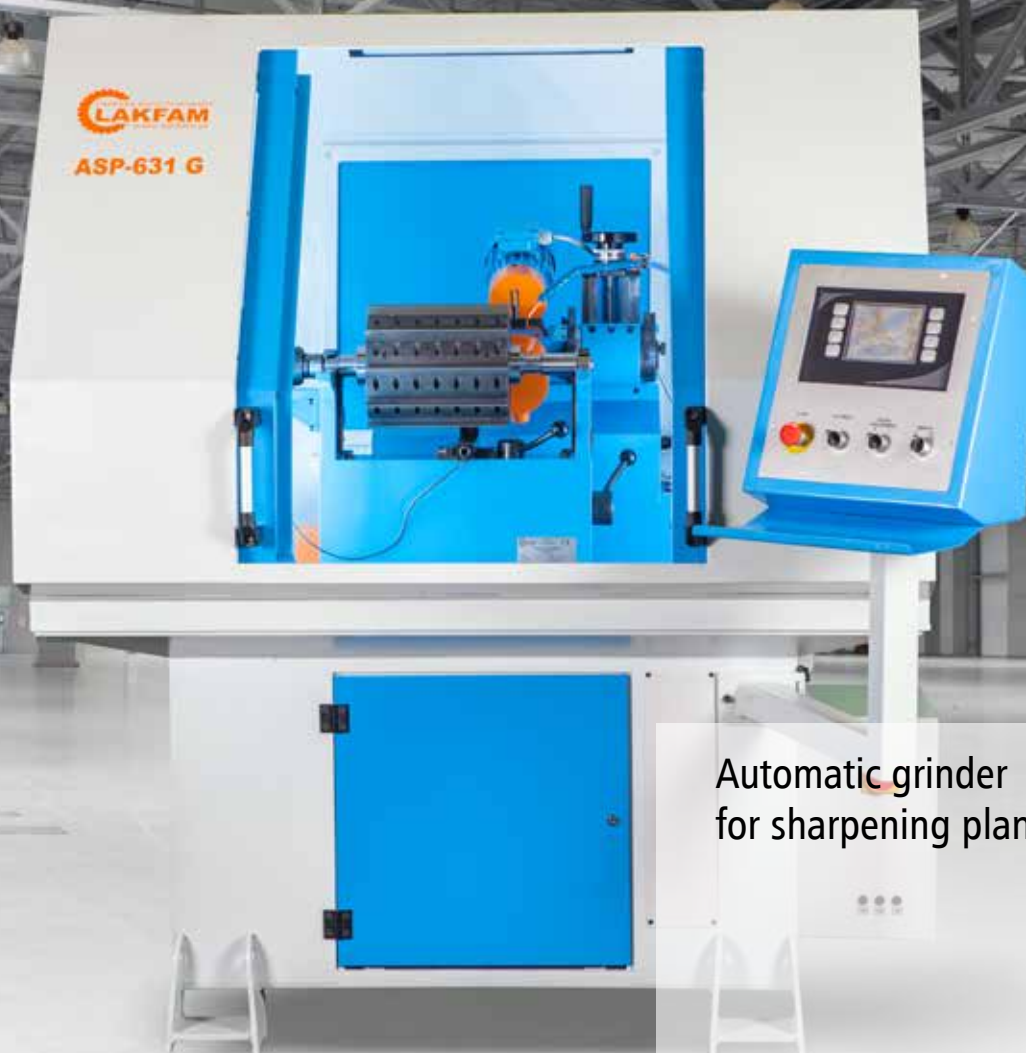
Automatic grinder for sharpening planer heads